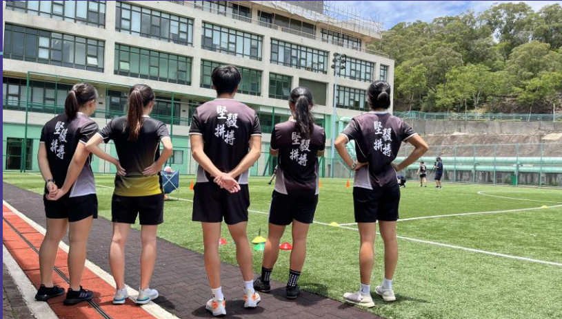
Postgraduate Diploma of Education (Physical Education)

Master's degree Master of Social Sciences in Sports Coaching and Management offered by the EdUHK